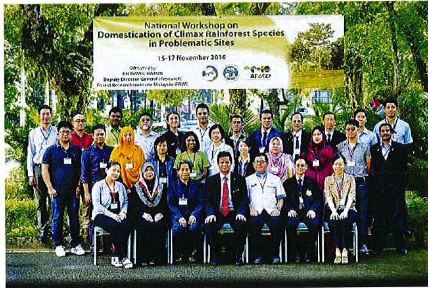
Group photo during opening ceremony of the workshop on 15 November 2017

Average satisfaction score: 4.35/5.00 (refer Appendix 1c)