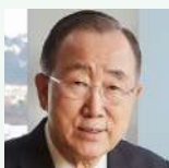
Mr. Ban Ki-moon

President & Chair of GGGI 8 th Secretary-General of the UN