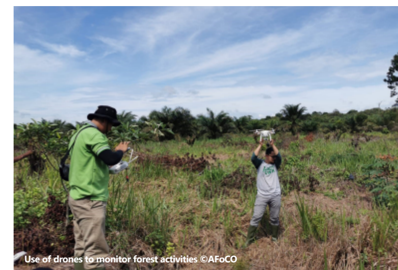
Use of drones to monitor forest activities

To provide a broader understanding of the impacts of forest crime and efforts to maintain the world's forests, the AFoCO Regional Education and Training Center organized the capacity building workshop on “Forest Crime and Sustainable Forest Management” from May 16 to 20, 2022. Drawing on the discussions shared among participants of the workshop, this policy brief presents recommendations on how to deal with forest crimes.